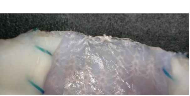
Developed own native tissue over the OFT-G1 (pre-clinical study)

Thanks to medical advances in recent decades, the vast majority of pediatric patients with heat diseases reach adulthood. A considerable number of these patients, however, eventually require re-interventions, such as repeat surgery or catheter therapy, due to problems with the implanted surgical materials. There still exist unsolved drawbacks of the existing materials, such as deterioration, calcification, and thickening with pseudo-intimal proliferation. Furthermore, such materials have no size adaptability to body growth. As a result, hemodynamic disturbance often occurred again to be treated by the re-interventions in their long life.