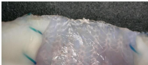
Developed own native tissue over the OFT-G1 (pre-clinical study)

Thanks to medical advances in recent decades, the vast majority of pediatric patients with heart diseases reach adulthood. A considerable number of these patients, however, eventually require re-interventions, such as repeat surgery or catheter therapy, due to problems with the implanted surgical materials. There still exist unsolved drawbacks of the existing materials, such as deterioration, calcification, and thickening with pseudo-intimal proliferation. Furthermore, such materials have no size adaptability to body growth. As a result, hemodynamic disturbance often occurred again to be treated by the re-interventions in their long life.